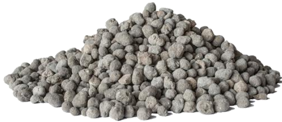
Figure 2. Typical M-LS sample

cannot be physically separated nor specifically identified at end of life. It is non-organic and therefore does not include biogenic carbon in biomass.