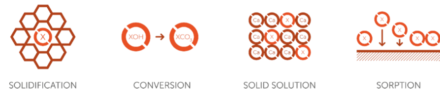
Figure 4: Solidification/Stabilisation Processes

mixture undergoes pelletising to form the rounded product. Further CO 2 naturally combines with the product whilst it undergoes curing and storage on site. The technology is adaptable to a wide variety of thermal residues including those arising from biomass, energy from waste, cement manufacture, steel and aluminium production, paper manufacture, and wastewater treatment. The reaction promotes rapid solidification and improves mechanical properties and modification of contaminant mobility (see figure 4). Carbonation results in a reduction in porosity due to the formation of voluminous calcium carbonate in the pore space. This aids the retention of contaminants through improved physical containment. Crystals of calcium carbonate join in an interlocking lattice, forming an unimpaired bond between grains.